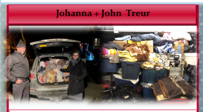
For Christmas socks, blankets and coats for the homeless -Thank you

Special Thanks to our Clothing and Supply Donors